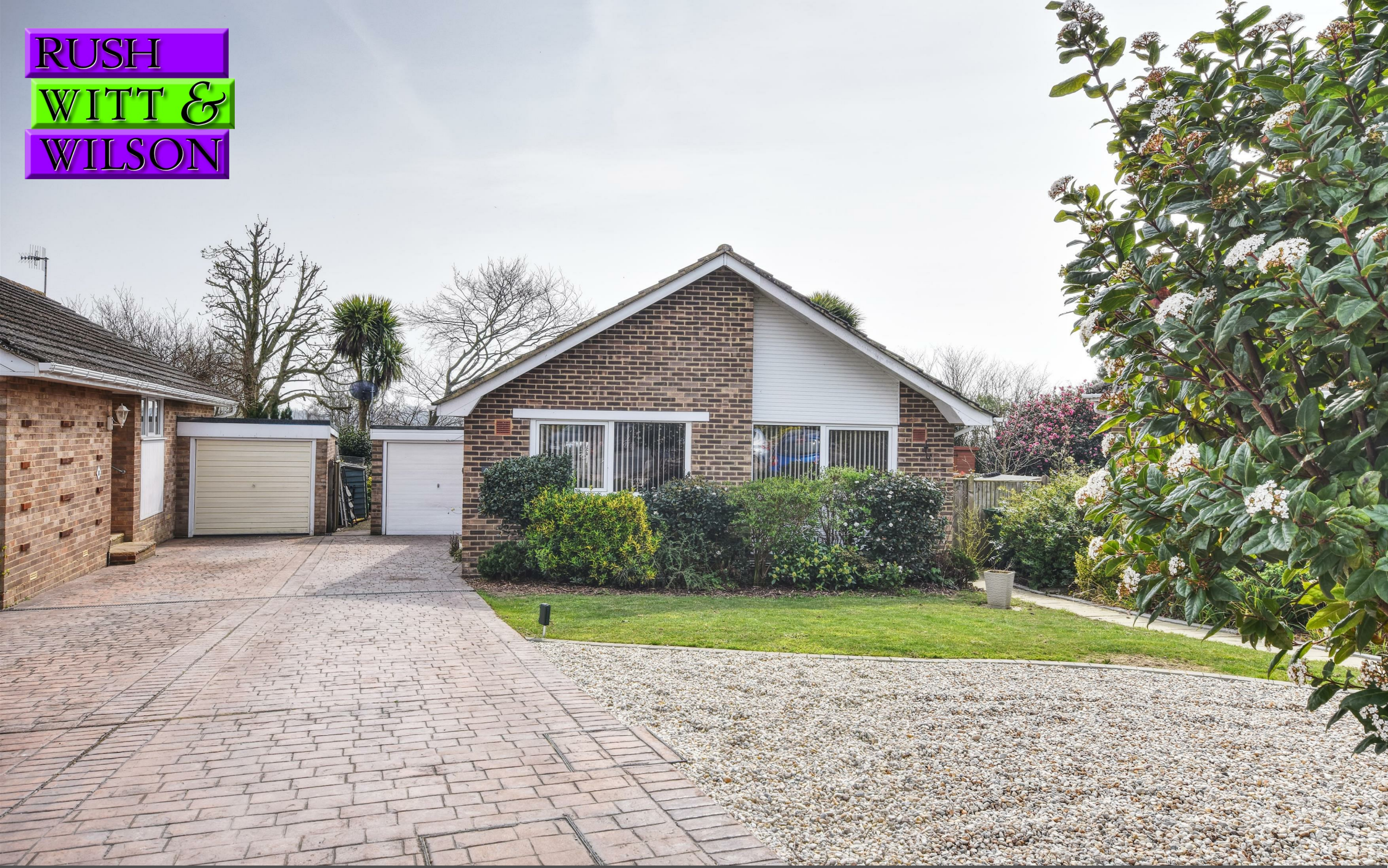
9 Beech Close, Bexhill-On-Sea, East Sussex TN39 4NW Offers In Excess Of £530,000